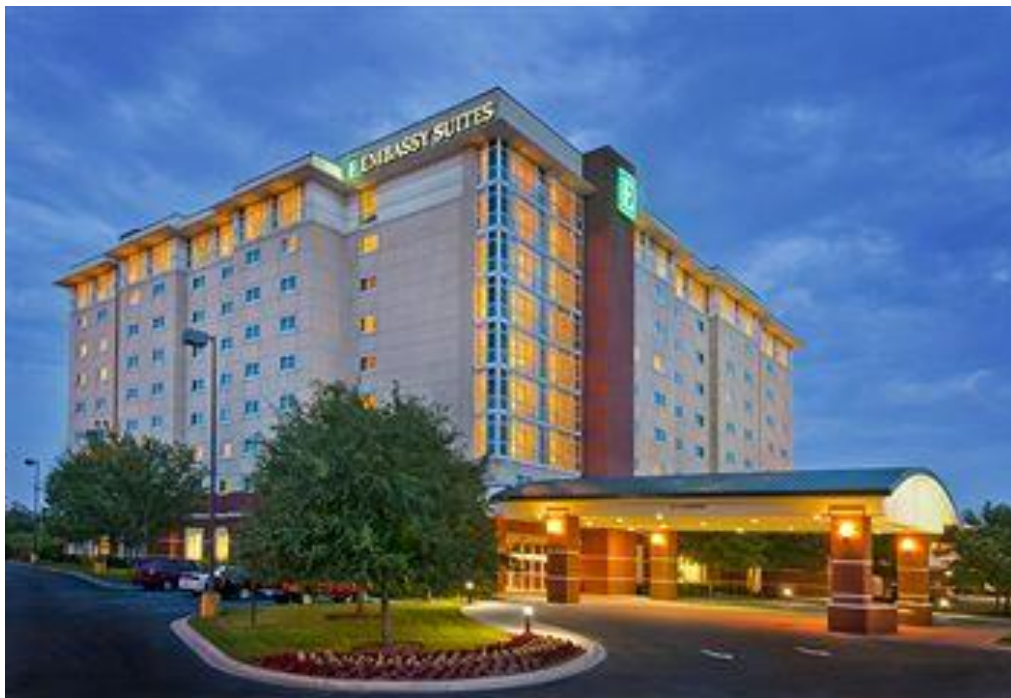
Embassy Suites North Charleston