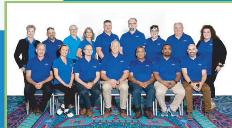
The Premier Conference for 3D Measurement Professionals